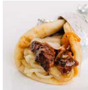
BBQ Melt Pita