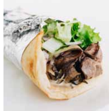
Roast Beef Pita