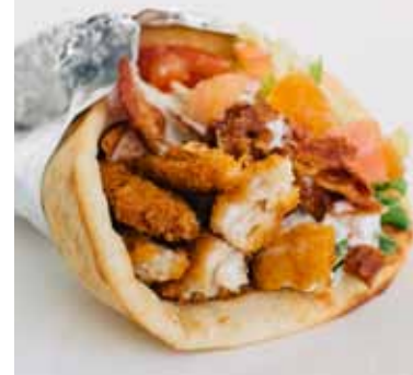
Chicken Tender Pita