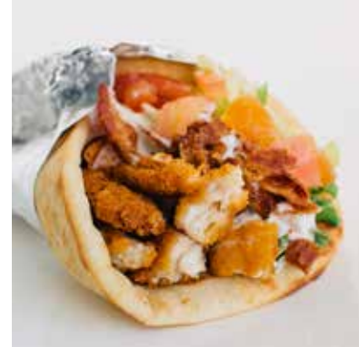
Chicken Tender Pita

fried chicken tenders tossed in mild wing sauce with lettuce, tomato, ranch, and bacon 9.99