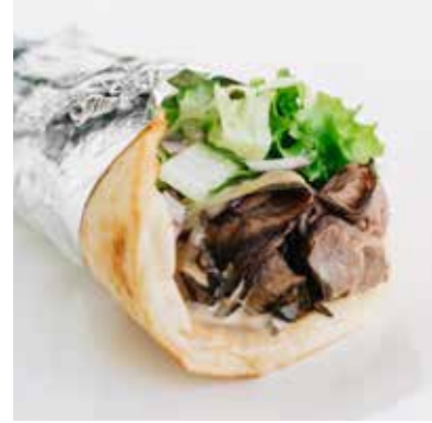
Roast Beef Pita