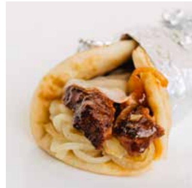
BBQ Melt Pita