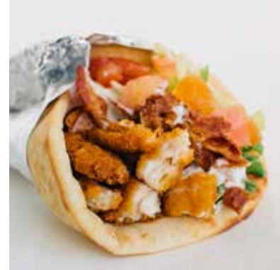
Chicken Tender Pita

crab cake, grilled baby shrimp, tiger sauce, lettuce, tomato, and onion 10.99